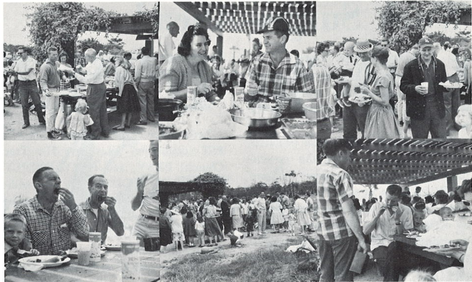
Pasadena B and C Clubs join forces with San Diego at San Clemente State Park.